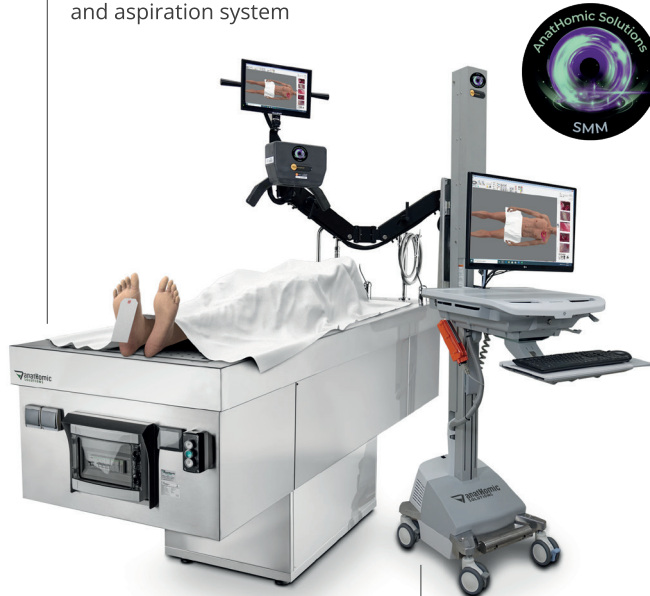
SMA-2 Mobile macro photography system

ME-101 ASP Autopsy table with elevation and aspiration system