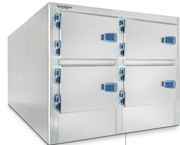
NET-304 Mortuary chamber 4 Bodies – 4 Doors

We can offer many optional elements and configurations so that the user has a customised solution that facilitates their work and ensures optimal preservation and traceability