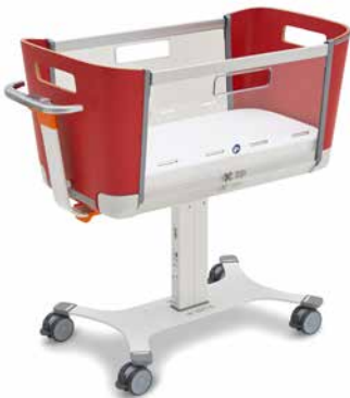
▲ Coloured design: Red U323 ST9