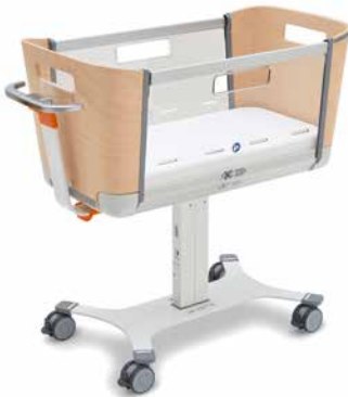
▲ Home style design: Maple wood decor H3840 ST9

Thanks to its attractive colour options and appealing design, the Jovie cot will also visually enhance any hospital unit. Young families will immediately feel comfortable and relaxed with this bed.