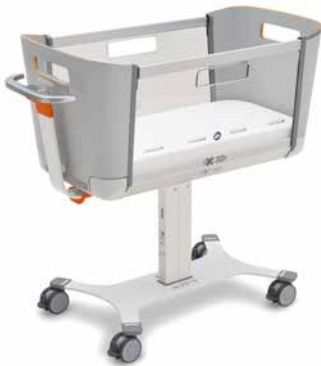
▲ Neutral design: Grey U708 ST9