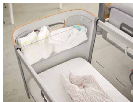
▲ Storage basket.